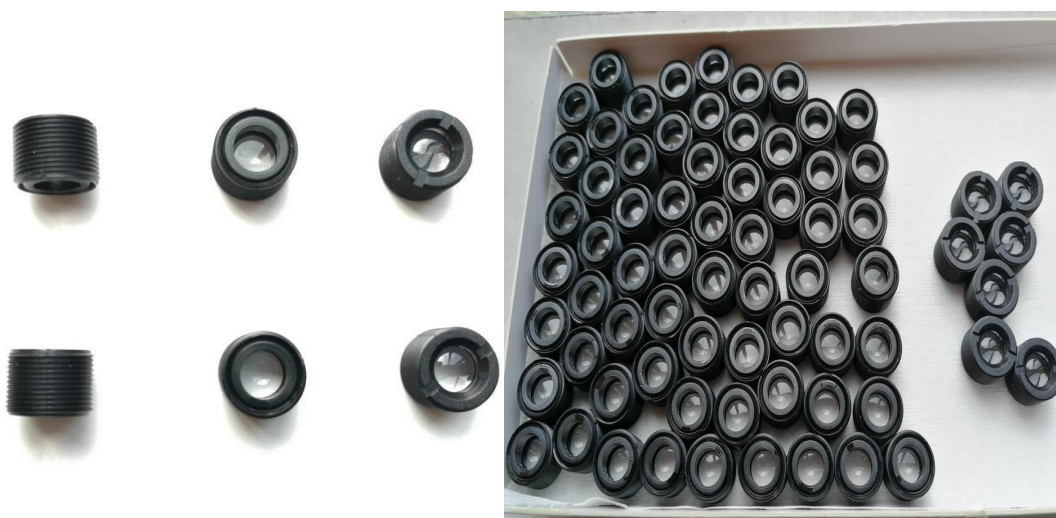
uncoated Laser diode collimating lens Focusing lens Convex M9*0.5mm for blue Laser diodes.